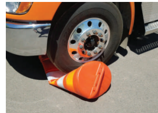
Rebounds after being run over!